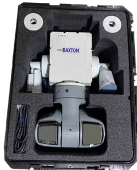
Travel Case Included Dimensions - 29" x 22" x 16" with wheels