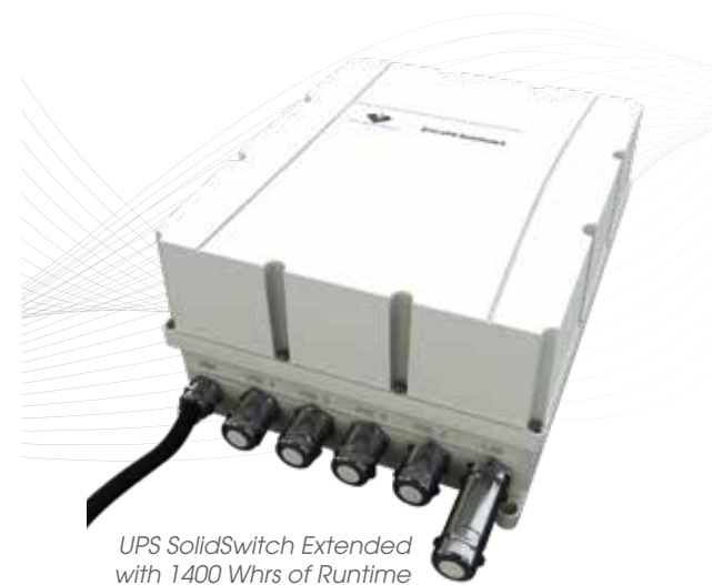
UPS SolidSwitch Extended with 1400 Whrs of Runtime