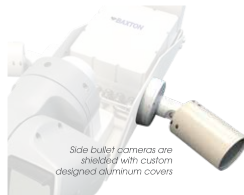
Side bullet cameras are shielded with custom designed aluminum covers